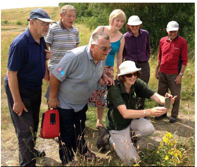
Forum members get to grips with identification software

Greenwood supports the Forum, by "sign posting" sources of advice, giving information and solving problems, also by providing some funding to cover the cost of meetings and administration. We also produce a Directory of groups for volunteer bureaux and for potential volunteers.