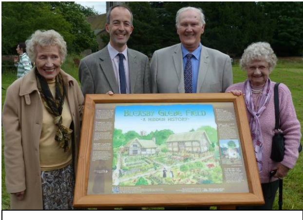
Local residents join County Councillors in celebration of Bleasby's Glebe Field

The Greenwood team actively promotes Nottinghamshire's Local Improvement Scheme to Friends and other community groups. Greenwood team members also directly supported a number of the funded projects, eight of which were located within Newark and Sherwood District: