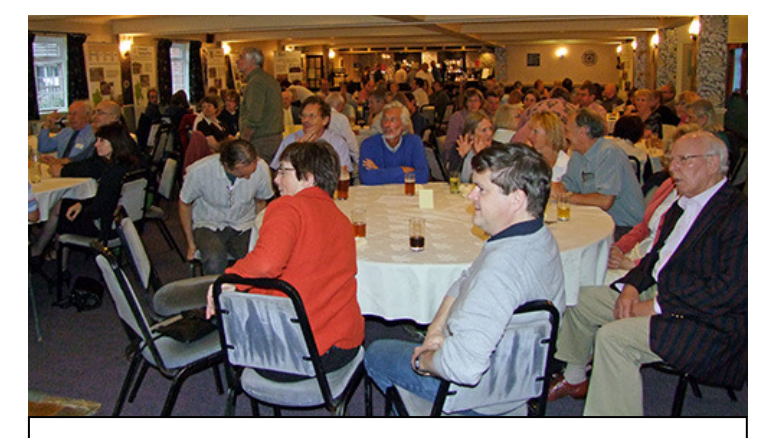
Anticipation builds at the start of the Awards

All local groups rely upon the time and effort of their volunteer members. Since 2001, Greenwood has recognised and encouraged these individuals through the organisation of awards for outstanding effort, as nominated by their peers. 2011's Awards Ceremony was a highlight of the Greenwood year, providing an opportunity to raise the profile of Friends groups whilst rewarding individual volunteers for their contribution.