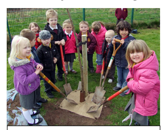
Tree planting at King Edward's Primary School

In the decade from 2000, Greenwood's Community Tree Planting Grant scheme provided grants totalling £44,850 and supported over 150 projects across the Greenwood area. In total, over 15,000 trees were planted involving nearly 6,000 participants.