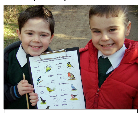
Peafield Primary visit their local park

The Greenwood team is experienced in delivering activities that are tailored to the needs of partners to add value to their ongoing projects. Such events help to develop community involvement on sites and to build relationships with community groups that have not previously been involved.