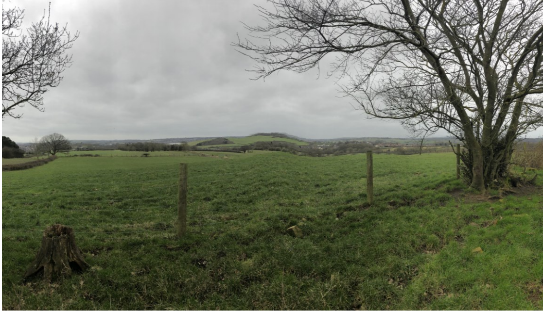
Views within Willey Wood Farm

“Excellent all-round proposals with a great long-term plan. This project should begin ASAP - look forward to helping out” – member of the community at the consultation event