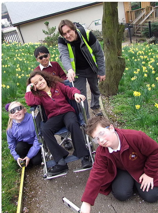
Schoolchildren helping with access audit in Arnot Hill Park

Whilst designing the sensory bed, the children also took the opportunity to support the access audit being carried out. The children used a wheelchair and special goggles to simulate physical and visual impairment, and then helped to assess different parts of the park from their new perspectives. The children were able to comment on issues such as the design of interpretation boards and accessibility of benches, also to consider the potential for a map showing slopes around the site.