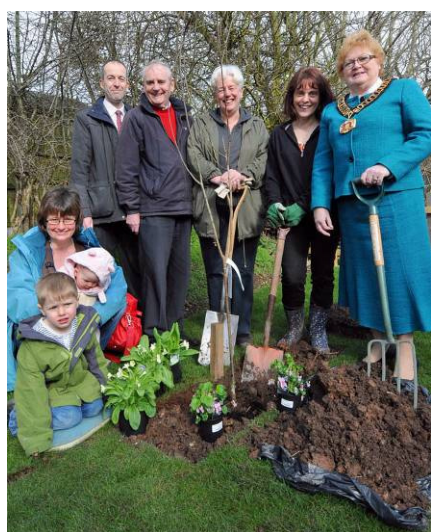
Tree planting on Killisick Allotments

http://www.defra.gov.uk/forestrypanel/reports/