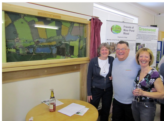
Friends of Moor Pond Wood celebrate their tenth birthday!

The Greenwood team also works with individual groups, helping to set up new groups where partners or the local communities have identified opportunities, and offering guidance and support to established groups on a range of matters.