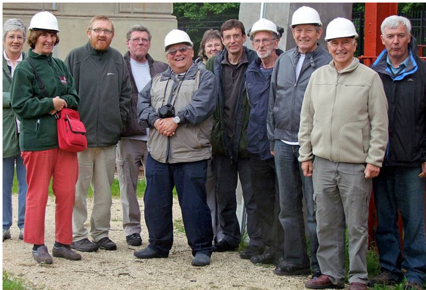
The Forum visits Bestwood