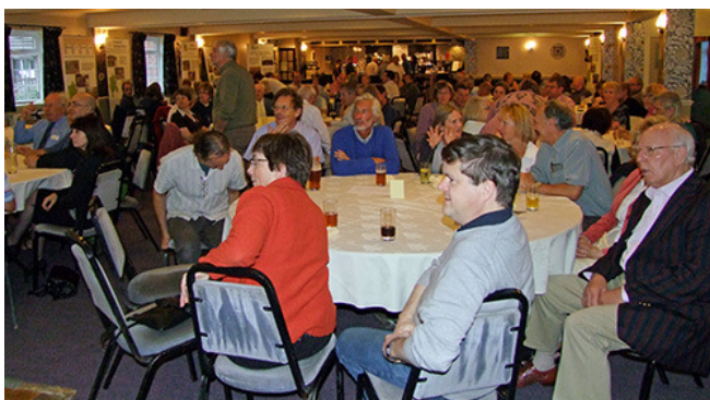
Anticipation builds at the start of the Awards

All local groups rely upon the time and effort of their volunteer members. Since 2001, Greenwood has recognised and encouraged these individuals through the organisation of awards for outstanding effort, as nominated by their peers. 2011's Awards Ceremony was a highlight of the Greenwood year, providing an opportunity to raise the profile of Friends groups whilst rewarding individual volunteers for their contribution.