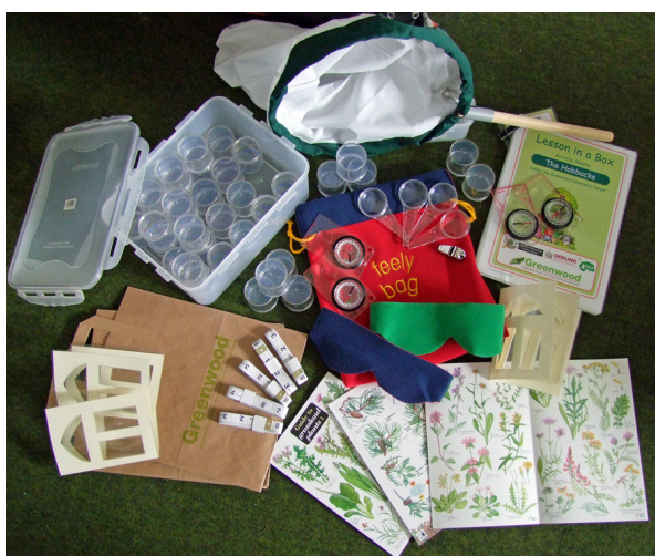
Contents of the Hobbucks "Lesson in a Box"