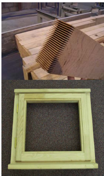
Green gluing: finger jointing and finished frame