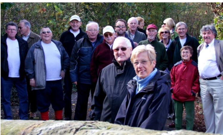
The Forum visits Quarry Lane

“Friends” groups have helped to improve, care for and promote the use of many green spaces, carrying out works on site and acting as a link to the general public. We established the Friends of Greenwood Community Forum to support the increasing number of such groups, and it has proved invaluable as a platform for discussion and as a mechanism for groups to support each other. In particular, many newly formed groups have gained confidence from hearing about the experience of others.