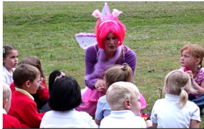
Fidget the Fairy at Bull Farm