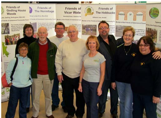
Friends with their new banners

Greenwood has funded the production of 20 modern “roller banner” displays to promote the activities of local Friends groups. These are high quality and portable displays, which allow individual groups to better publicise their own activities, raising the profile of their own parks whilst also encouraging more volunteers to come forward.