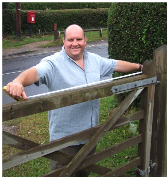
Measuring up for access audits

Officers from the Greenwood Partnership have considered our key findings and recognised that the audit process could provide data to help in improving access for all and supporting quality assurance schemes such as Green Flag. We hope to audit more partner sites in the period ahead.