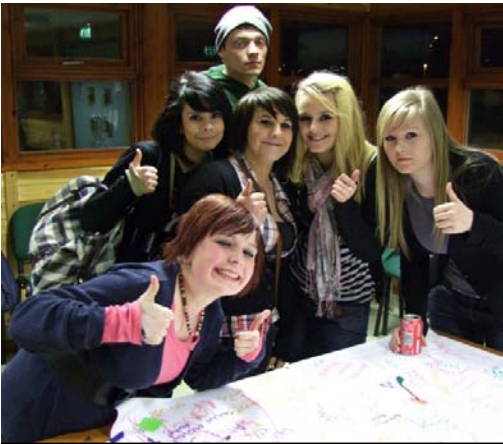
Youth consultation at Titchfield

“There was an excellent turn out and we would like to thank all the young people who were involved and gave their informative comments. We will use this information to help us develop and enhance the park.”