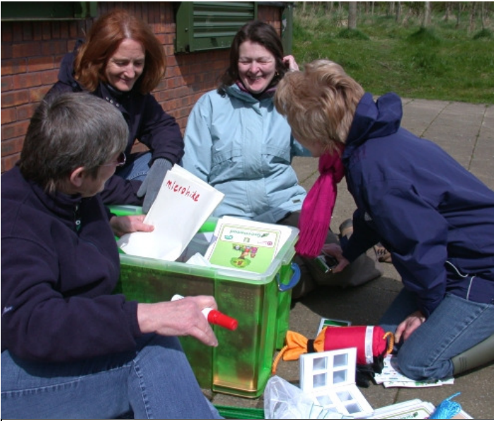
Teachers try out Lesson In A Box

Greenwood has promoted the concept of “Lesson in a Box” (LIAB), a site-based educational resource pack. LIAB is intended to make it easy for teachers to use a specific site for environmental learning, including ideas for activities linked to the national curriculum, together with guidance and any equipment necessary to run the activities. We have produced LIABs for three sites, with a fourth in progress. We are also talking to more Friends groups about seeking grant aid to support LIAB production for their own sites.