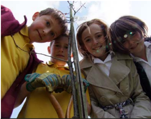
King Edwards School tree planting

The Greenwood Community Tree Planting Grant (GCTPG) scheme was established in 2000 and has since provided grants totalling £44, 850 for over 150 projects across the Greenwood area. We've helped nearly 6,000 adults and children to plant over 15,000 trees.