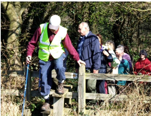
Mansfield In Step

The Greenwood team also supported the original formation of a number of Walking the Way to Health groups and continues to offer help. We helped Mansfield "In Step" to submit a successful application to Nottinghamshire Community Foundation for the purchase of equipment valued at £500.