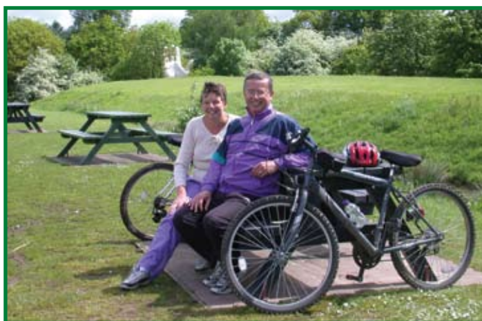
New leisure opportunities.

Over the last year, the Greenwood Partnership has been reviewing its successes and looking at plans for the future. A new Strategic Plan will be published later this year, to redefine Greenwood's purpose and main aims for the years ahead. Turn to page 4 to take a look at what's already been achieved and our plans for the future.