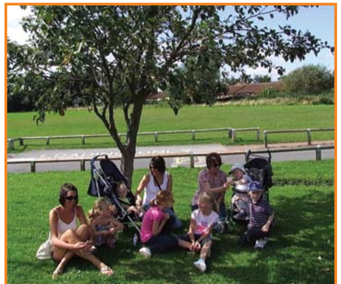
A shady place to picnic

So if you are keen to get involved, contact Nic Wort on 01623 827328 or visit our website www.greenwoodforest.org.uk