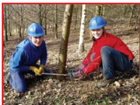
Local people caring for green space.

The Greenwood Partnership, made up of local authorities and other key organisations, has driven this forward. The Partnership has been responsible for working with local people to consider the needs of the area and putting new projects in place to meet those needs.