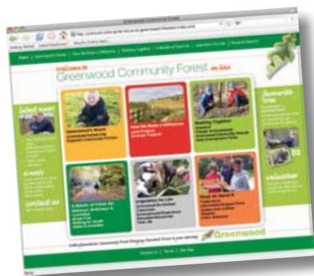
There's a new look to the Greenwood website.

New features have been introduced including interactive maps of places to visit, educational resources and an events page. There's lots of information about how you can volunteer, help to plant trees or look after your local green space. Visit us at www.greenwoodforest.org.uk and tell us what you think.